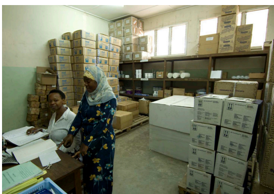
Documentation is critical (T. Schuppisser)