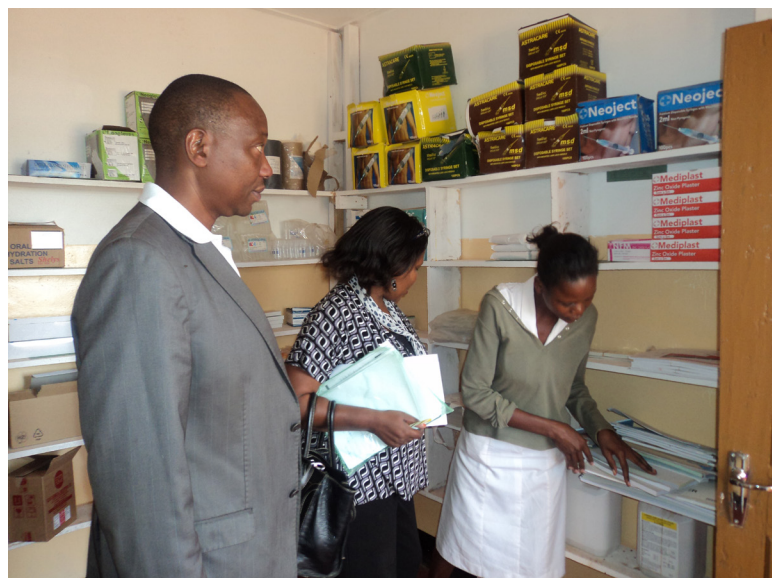
Auditing a pharmacy store (S. Mapunjo)

Leakage of medicines at various junctures of the supply chain is not uncommon